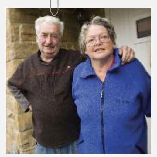
A small affordable housing development in Chop Gate provided houses for elderly couples and young families.

But when the district council conducted a housing needs survey, they found 22 local households with housing needs. This included eight households currently living in the parish, seven who worked