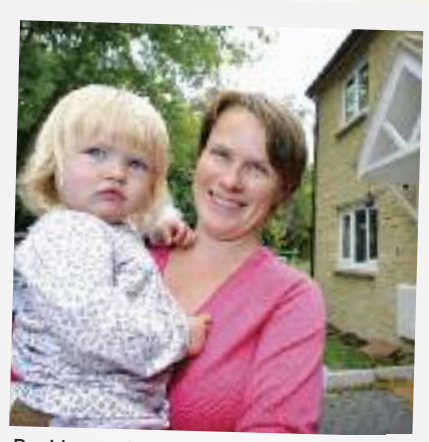
Residents of Cottsway Housing's development of five homes at Akeman Rise, Ramsden, Oxfordshire.