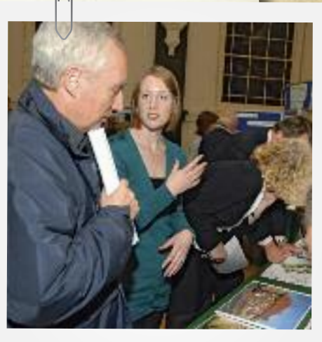
Hungerford people shaped the new development.

For some time there had been concerns around the lack of affordable housing for local people. That is why in 2008, the Town Council asked the Rural